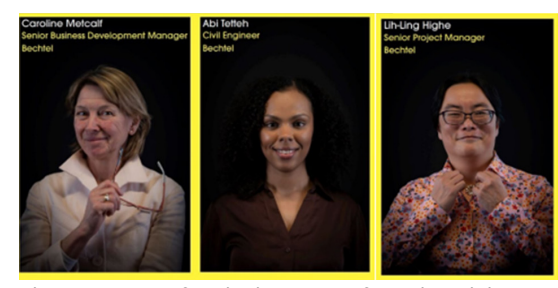
Three portraits of Bechtel engineers from the exhibition

We were delighted to co-sponsor SHE BUILDS UK — an initiative using portrait photography to celebrate female role models from the construction industry. It included a pop-up exhibition in London, a larger online exhibition, and an appeal for women from across the industry to inspire others to follow their lead. This was the brainchild of Neil Perry, who decided to act after his 7-year-old daughter commented that 'only men are builders.'