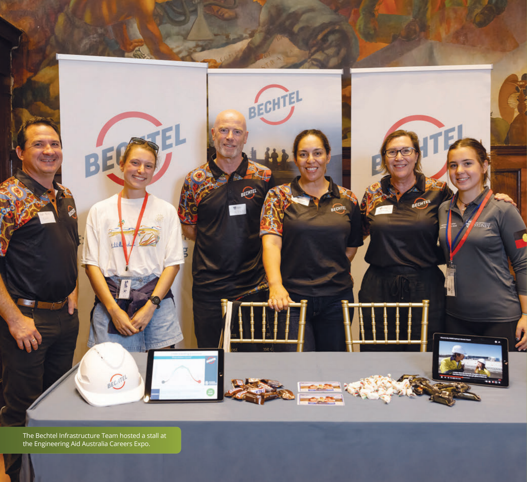
The Bechtel Infrastructure Team hosted a stall at the Engineering Aid Australia Careers Expo.