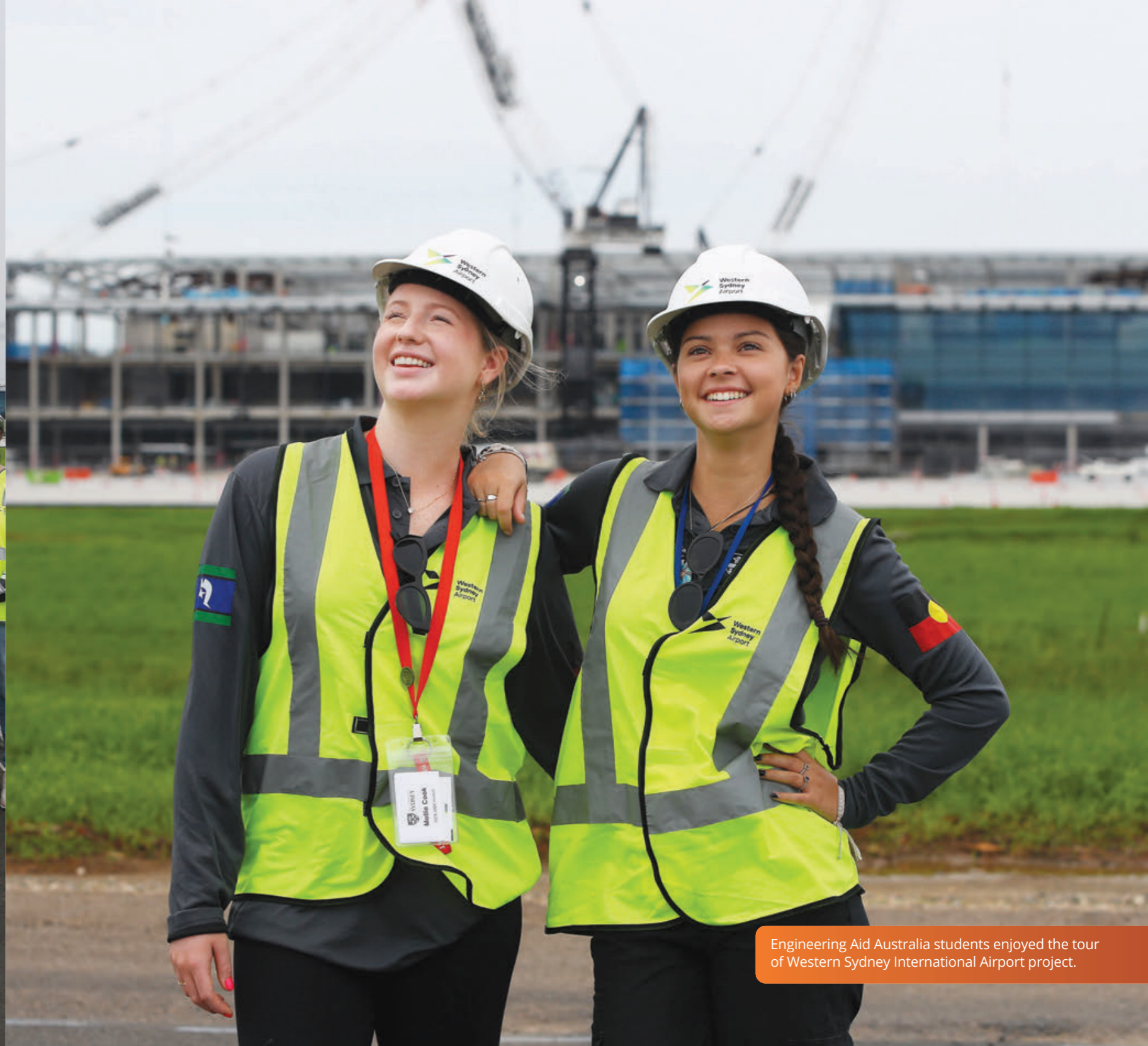
Engineering Aid Australia students enjoyed the tour of Western Sydney International Airport project.