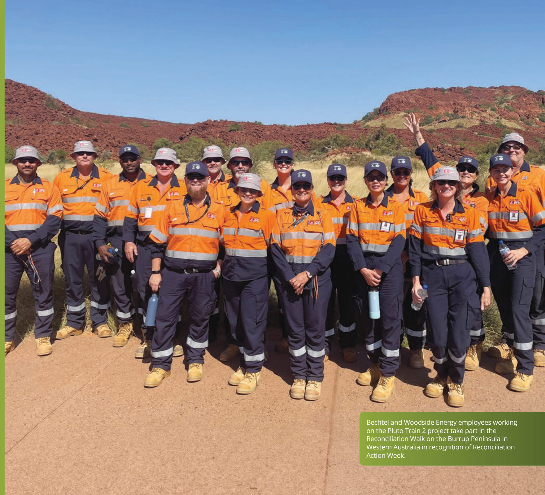
Bechtel and Woodside Energy employees working on the Pluto Train 2 project take part in the Reconciliation Walk on the Burrup Peninsula in Western Australia in recognition of Reconciliation Action Week.

A connection to Country story. All of us play a role in looking after and sustaining this beautiful part of the country. The whale is a sacred creature for the Gadigal people and other nations along the coast. It's believed that the whale is the creator of the water ways and coastlines using its body to shape the landscape. The whale navigates its way following the skies. The goanna is the totem of the land. I wanted this painting to reflect the Dreamtime and the beauty of Gadigal Country.