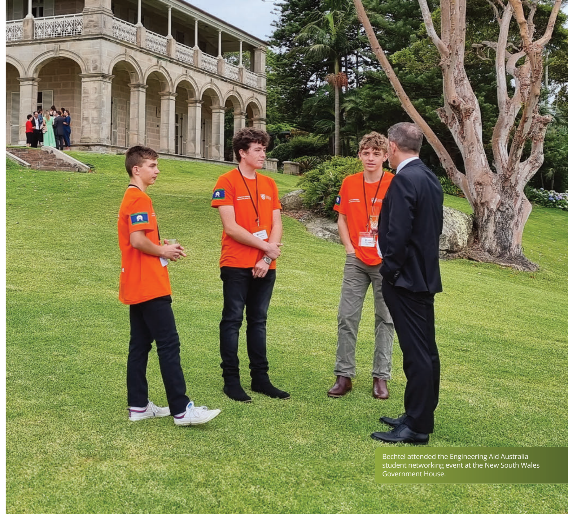
Bechtel attended the Engineering Aid Australia student networking event at the New South Wales Government House.

NYFL-Tutt Bryant's social enterprise business model means that the profits they make will be put back into the community, supporting not-for-profit programs such as youth sports and a local supermarket. The partnership between NYFL-Tutt Bryant and Bechtel will help support First Nations people in the region, providing employment and training opportunities for local people.