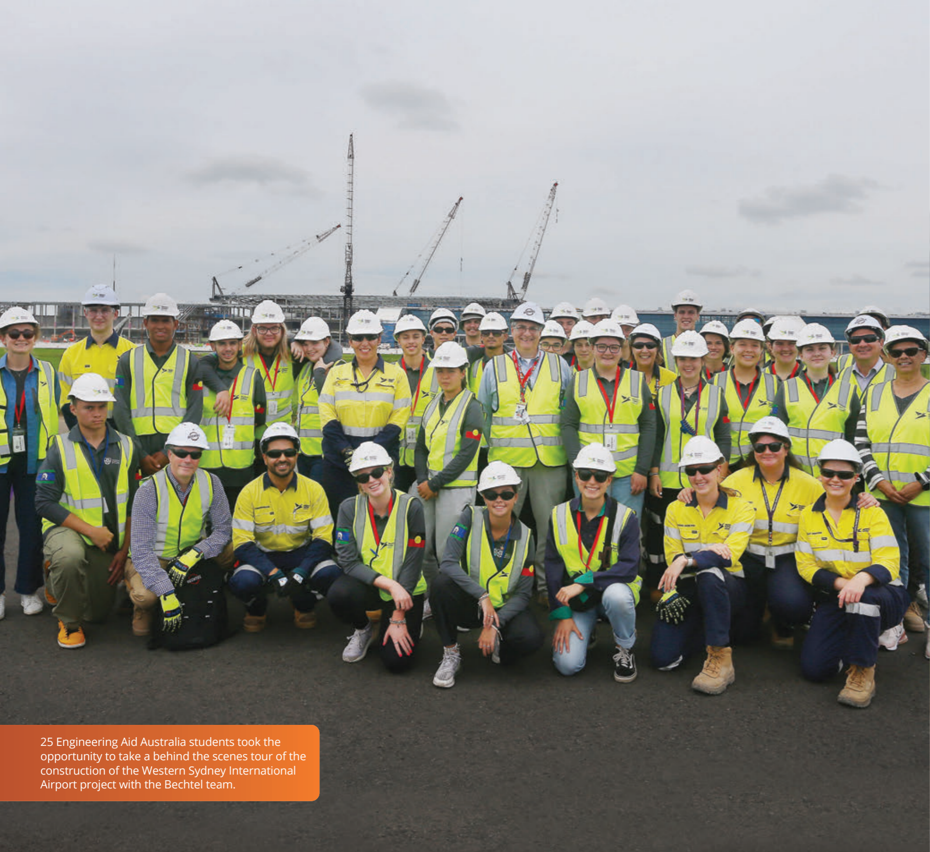
25 Engineering Aid Australia students took the opportunity to take a behind the scenes tour of the construction of the Western Sydney International Airport project with the Bechtel team.