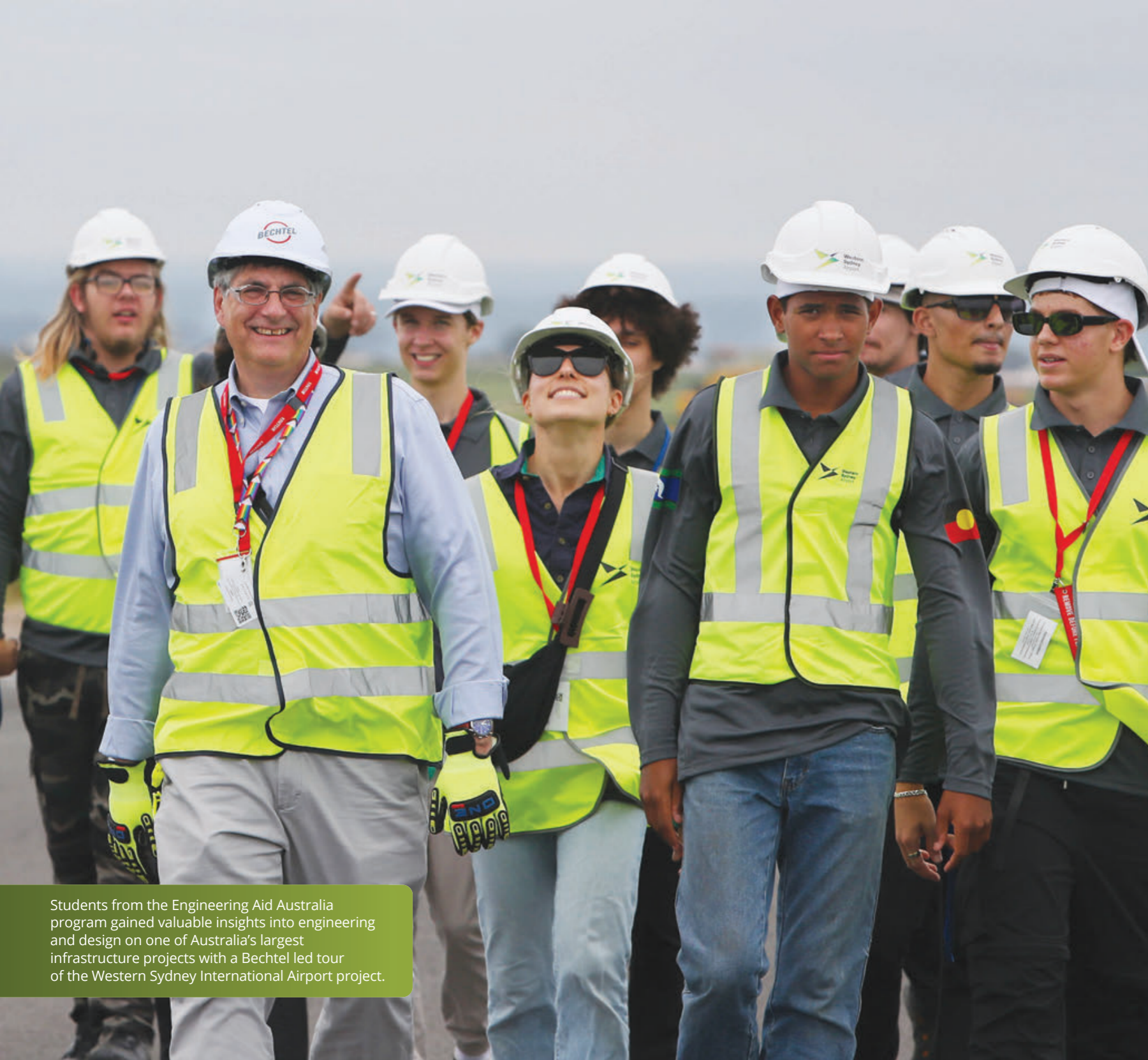
Students from the Engineering Aid Australia program gained valuable insights into engineering and design on one of Australia's largest infrastructure projects with a Bechtel led tour of the Western Sydney International Airport project.