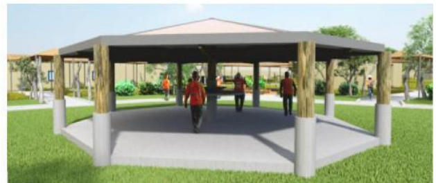
Figure 6. Virtual Reality image of Chivarri, the Traditional Owner area, in the Amrun Village.

Amrun Engineers have been heavily involved in the development of the Virtual Reality tool, from working with designers, to trialing and sharing the tool with their engineering and design colleagues from around the world.