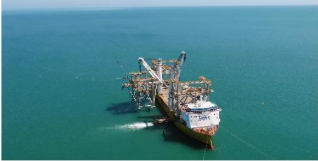
Figure 3: Aerial image of first Heavy Lift Vessel.