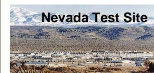
Nevada Test Site