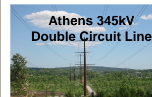
Athens 345kV Double Circuit Line