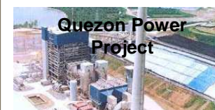
Quezon Power Project