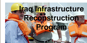
Iraq Infrastructure Reconstruction Program