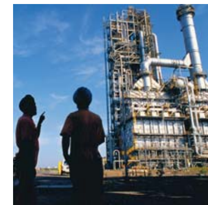
Jamnagar Refinery, India