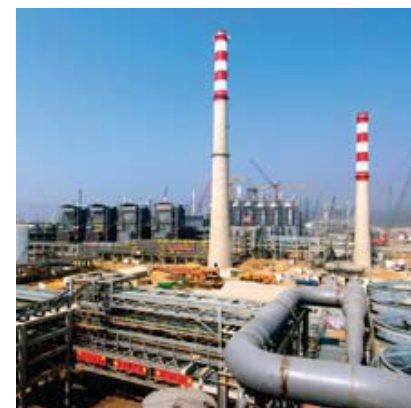
Nanhai Petrochemicals Plant, China