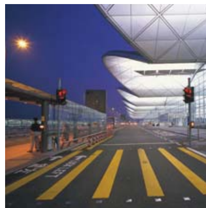
Chek Lap Kok Airport, Hong Kong